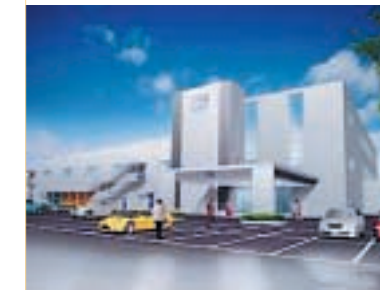
USS Kobe Site

A new site is under construction on a 66,000-square-meter lot purchased by USS in the Port Island City section of Kobe. Slated to open on September 11, 2005, the new site is situated in an easily accessible prime location close to the future site of New Kobe Airport. It will feature a seven-story, eight-layer all-weather stockyards with a storage area for 6,500 vehicles. The state-of-the-art auction facilities will include a four-lane auction system and 1,100 point-of-sale (POS) terminals. USS aims to attract 5,000 vehicles per auction.