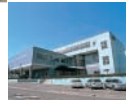
USS-R Tokyo Site