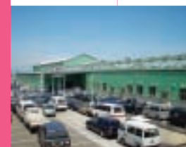
USS-R Nagoya Site

In August 2003, USS began auctions for reusable vehicles, which are defined as older models in good condition capable of adding more miles despite the high mileage already recorded. In June 2004, an auction site dedicated to reusable vehicles, the USS-R Nagoya site, opened its doors as the first such auction site in Japan. It was followed by another site for reusable vehicles, the USS-R Tokyo site, which opened in May 2005. In addition, USS is attempting to boost the auction market for reusable vehicles by improving trading conditions, lowering consignment fees, and reducing transport costs borne by participants. USS is also taking steps to encourage the listing of reusable vehicles by setting up a scheme that allows consignors to sell their vehicles to USS if the vehicles are considered to have no resale value and remain unsold.