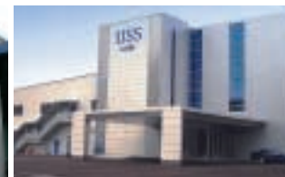
Kobe Auction Site