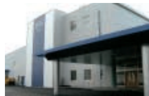
Osaka Auction Site