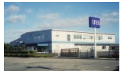
Fujioka Auction Site