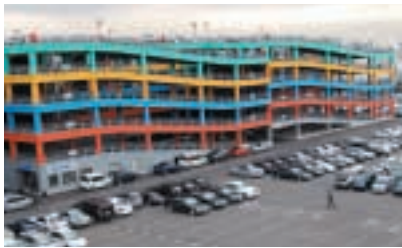
The Area’s Best Site, USS Nagoya (Parking Garage)

good-quality vehicles and consequently a number of members, thus ensuring a higher contract closing rate. To reinforce USS’ claim to be the best in each area, a variety of expansion and upgrading initiatives are underway, including construction of new sites and revamping of existing sites.