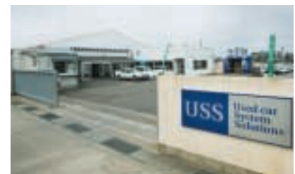
Hokuriku Auction Site

Together with the Gunma auction site, this site has become a consolidated subsidiary via a capital increase through third-party allocation, to establish a firm operations base in the Sea of Japan coastal market. In the 2006 calendar year, the site put up 34,726 vehicles for auction, with 14,489 completed contracts.