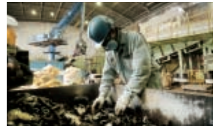
ARBIZ Recycling Plant

The scrap rubber recycling business recycles the rubber chips created by crushing discarded tires for use as resources in play equipment and artificial lawns. Although soaring oil prices have brought about higher raw material costs, business is progressing steadily due to increased production efficiency and improved sales efforts.