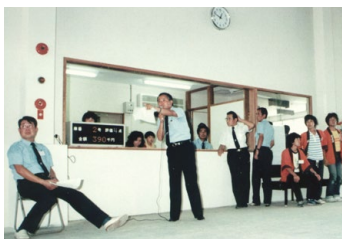
The first used car auction

August 1982 Opened the Nagoya auction site in the city of Tokai in Aichi prefecture. Held the first used car auction, where 255 vehicles were consigned.