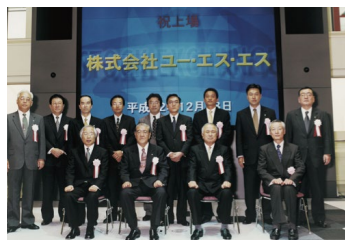
Celebrating the first section listing in Tokyo Stock Exchange of USS stock

December 2000 USS stock was listed on the first sections of the Tokyo Stock Exchange and Nagoya Stock Exchange.