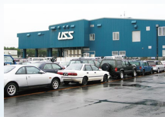
The newly opened Sapporo auction site

March 1998 Opened the Sapporo auction site in Ebetsu in Hokkaido.