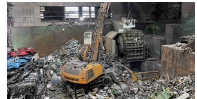
Recycling December 2003

Started used vehicle purchasing and selling business