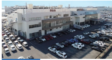
Auto auctions March 2018

Acquired Japan Automobile Auction Inc. as a wholly owned subsidiary