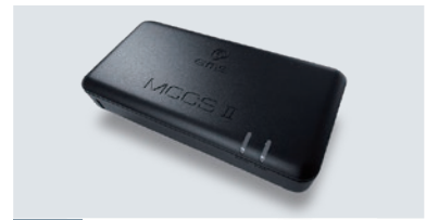
New April 2023

Established SMART Inc. and launched the industrial plant recycling business