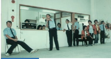
Auto auctions August 1982

Started auctions aiming to give everyone fair and equal standing