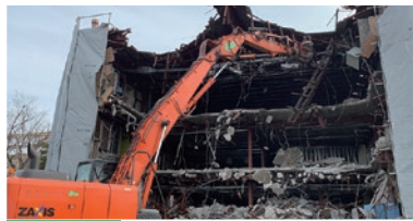
Recycling April 2019

Established SMART Inc. and launched the industrial plant recycling business