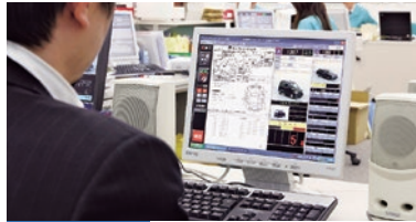
Auto auctions November 1999

Started satellite TV auctions (currently dedicated terminal auctions)