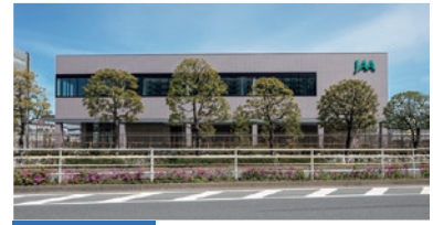
Auto auctions October 2021

Acquired Japan Automobile Auction Inc. as a wholly owned subsidiary