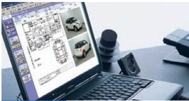
Auto auctions October 2005

Merged Japan Automobile Auction Inc. and HAA Kobe Inc.