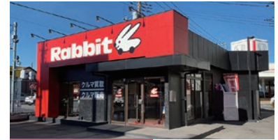
Used vehicle purchasing and selling October 2001

Listed USS stock on the First Section of the Tokyo Stock Exchange (current Prime Market)